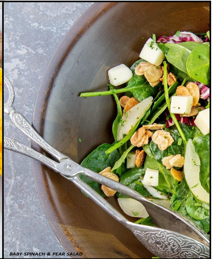
BABY SPINACH & PEAR SALAD