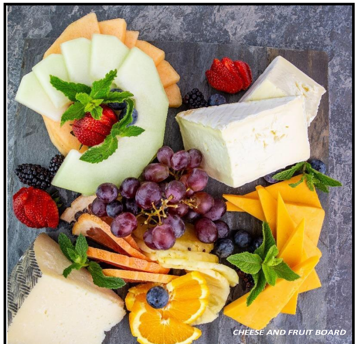
CHEESE AND FRUIT BOARD

PETITE 50.00 / SMALL 125.00 / LARGE 215.00