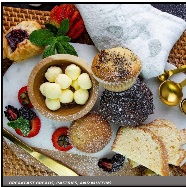
BREAKFAST BREADS, PASTRIES, AND MUFFINS