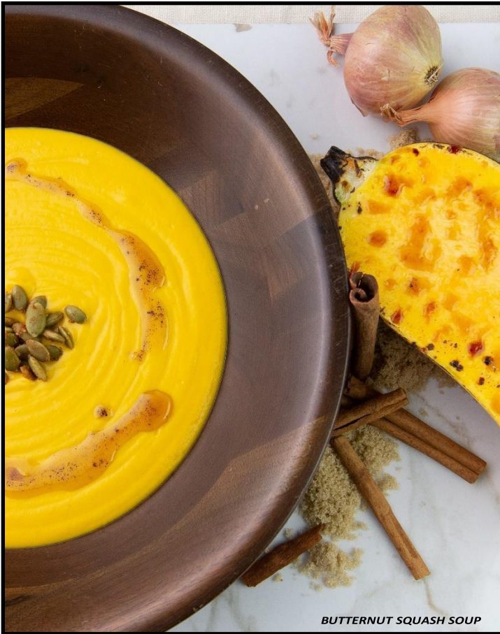
BUTTERNUT SQUASH SOUP